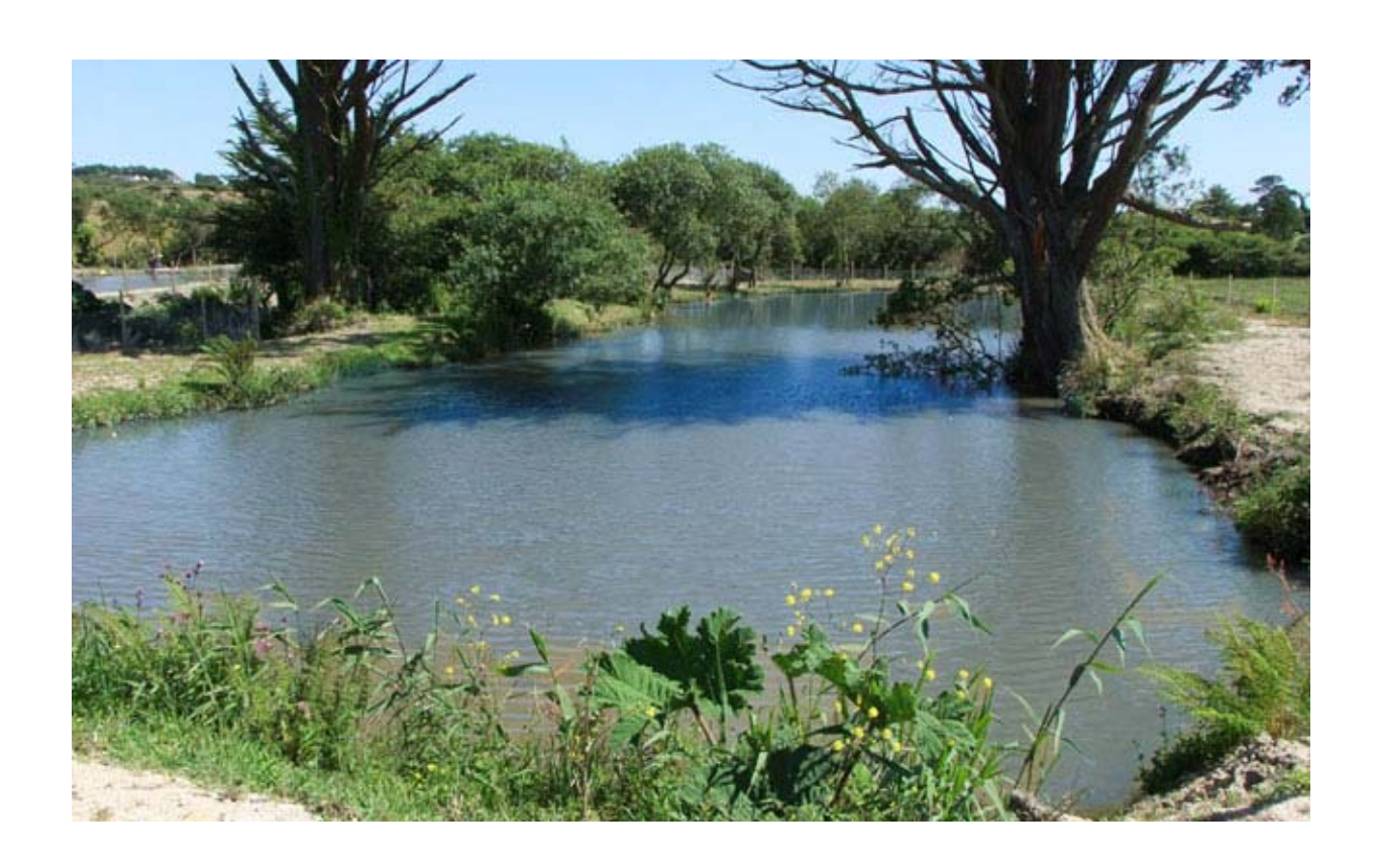
Government of India Ministry of Water Resources, River Development and Ganga Rejuvenation